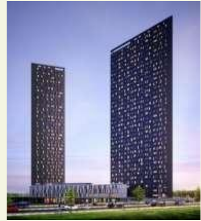
PALM MARIN APARTMENT