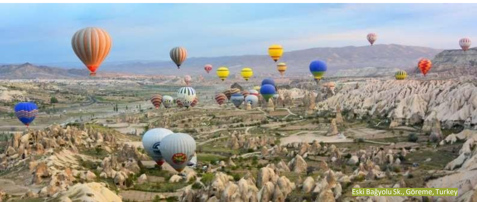
Eski Bağıolu Sk., Göreme, Turkey